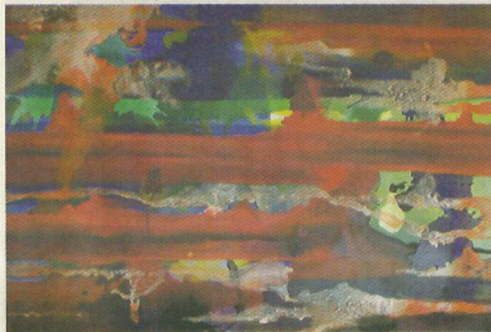
An untitled piece by German artist Judith Ganz. Mixed media on canvas, 2012.

"Growth is intended to expand conversation about the nature and boundaries of art in the Caribbean by exposing the public to a variety of approaches to creating contemporary art," said a release from the Caribbean Museum Center for the Arts.